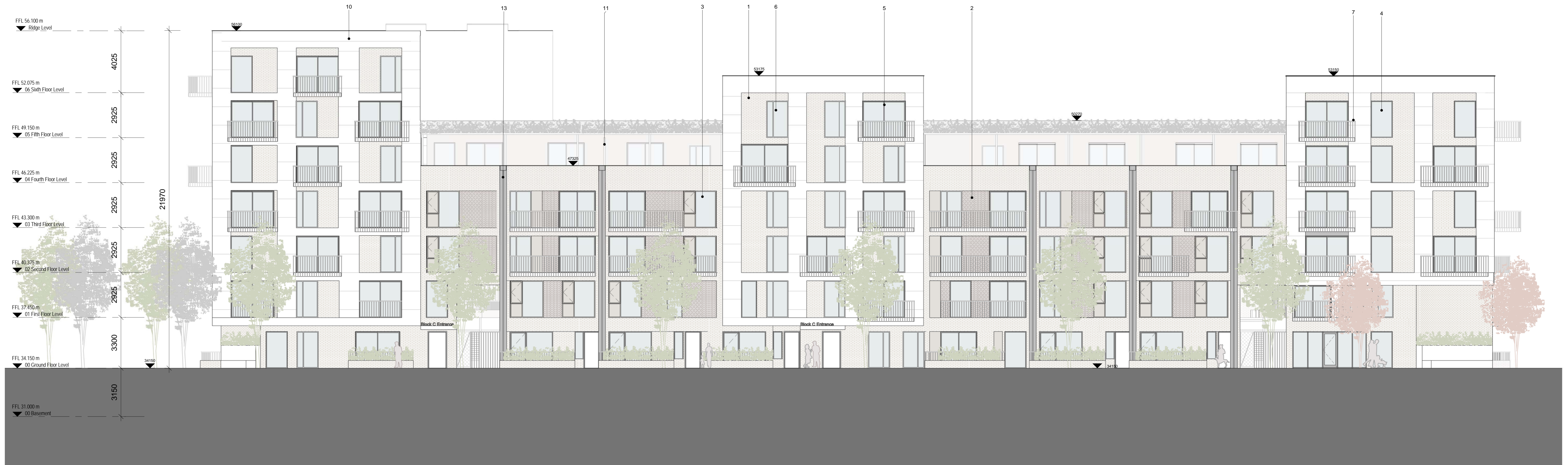
1 Elevation NW 1 : 100